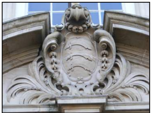
The crest over the door