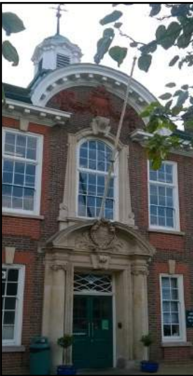
The main entrance

Twitter ( @openhouselondon ) with the hashtag #openhouselondon