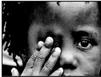
2. Rwanda 2