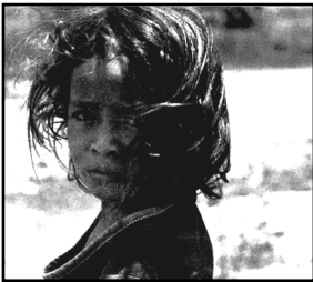
1. Rwanda 1

Before the deadline on Friday 19 th January, 2018