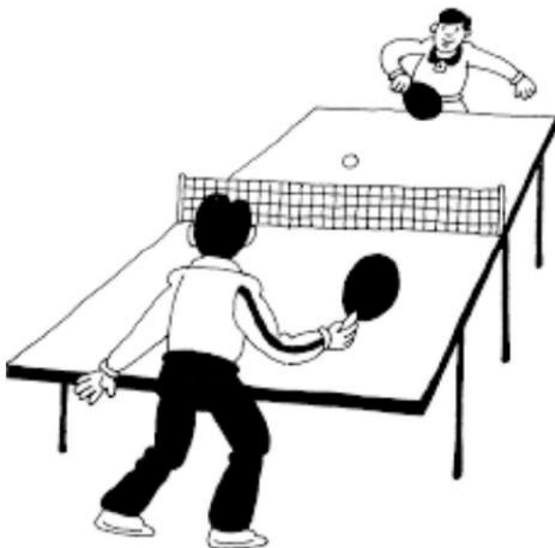
Table Tennis Sessions starting on 27th February 2018

Mondays 3:30 pm-4:30 pm In the Table Tennis hall