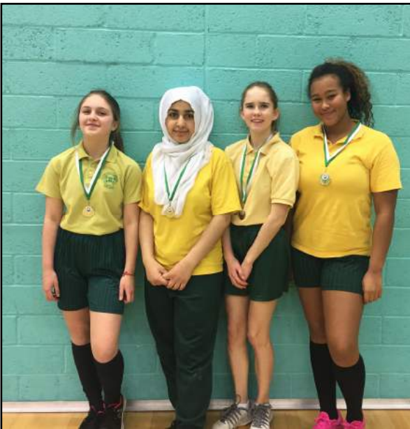
Year 10 volleyball team