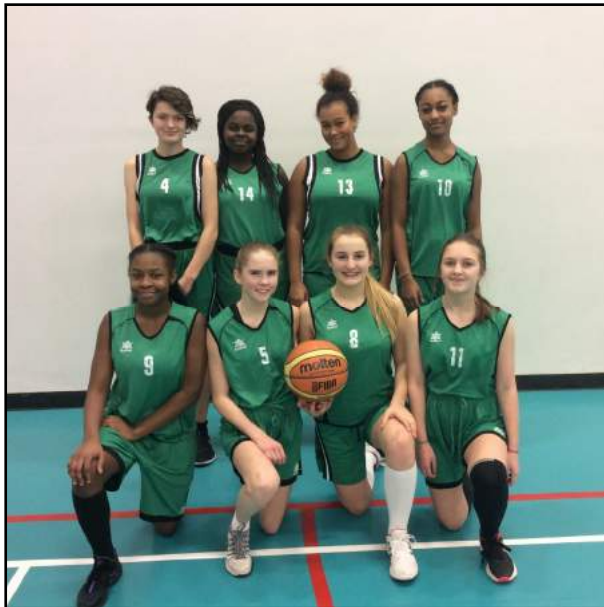
Year 10 basketball team