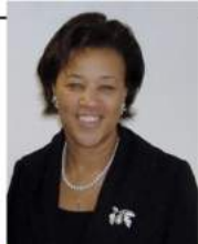
Patricia Scotland Baroness Scotland of Asthall, WSFG student 1967—1969 Attorney General for England and Wales 2007 to 2010

Patricia was born in Dominica, and her family emigrated to Walthamstow when she was two years old.