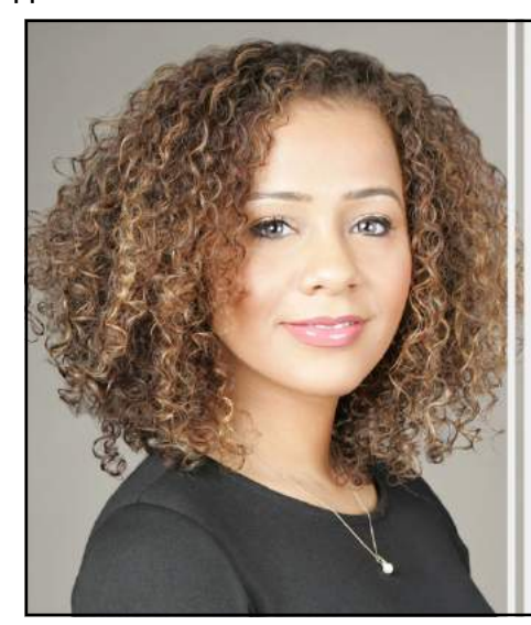
Miranda Brawn Diversity Leadership Foundation & Color In Tech

See our Autumn Greensheet plus 2016 for further details http://wsfg.waltham.sch.uk/downloads/doc_download/866-greensheet-plus-autumn-2016-