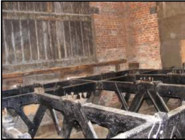
Refurbished bell tower with sound proofing

St Mary's Church are planning a celebration/dedication event on Saturday 8th October at 7:00pm at St Mary's Church and are inviting all organisations that have worked with the church on the bells project to go along and join in.