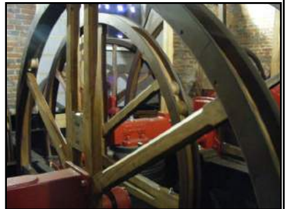
Refurbished bells back in the bell tower.