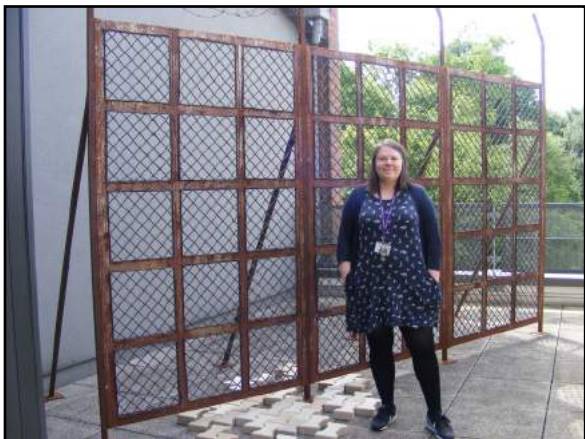
Tana's previous work

The resulting work by the artists will be shown in a group exhibition at Jerwood Space in summer 2019. A curatorial development programme to run alongside the exhibitions will be made possible with Art Fund support.