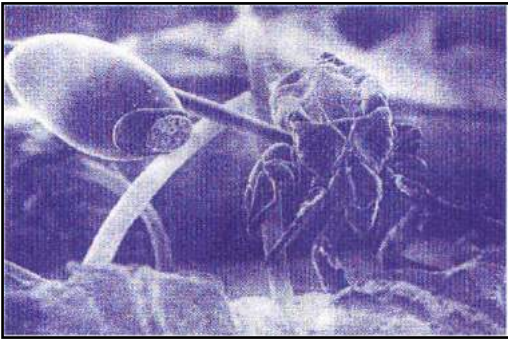
magnified photo of the human head louse and louse egg (nit).

Head lice need to maintain contact with a host in order to survive. Those lice that leave the host voluntarily, or fall off, are likely to be damaged or approaching death (their life span is about 3 weeks) and so unable to start a new colony. There is no need to wash or fumigate clothing or bedding that comes into contact with head lice.