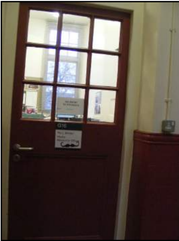
Door at WSFG