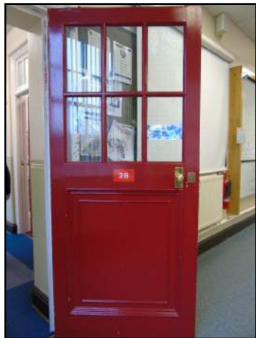
Door at Wren Academy