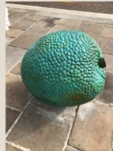
Breadfruit ( Artocarpus altilis )