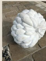
Custard apple ( Annona squamosa )