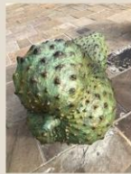
Soursop ( Annona muricata )