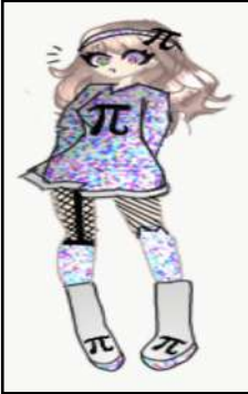
Madeeha 7G - Pi Girl