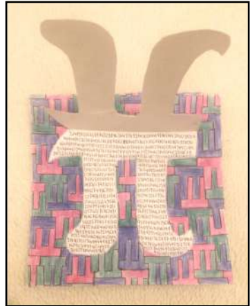
Hibba 7G - Pi with wings