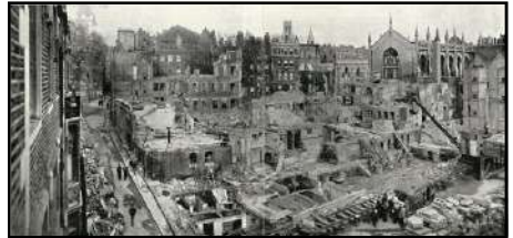
Destruction in the Temple taken from Middle Temple Lane looking towards Temple Church, c.1940-c.1944

The damage done to the Middle Temple- which can never be repaired- was the saddest thing I saw: its famous library is also badly damaged. Seeing St. Paul's as it always has stood, outlined against the sky, was the scene which seemed to me to be the most wonderful, and the one for which to be the most thankful, when we remember how very near we did actually come to losing it. Without St. Paul's London would not have the same atmosphere.