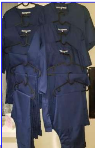
Scrubs for North Middlesex University Hospital