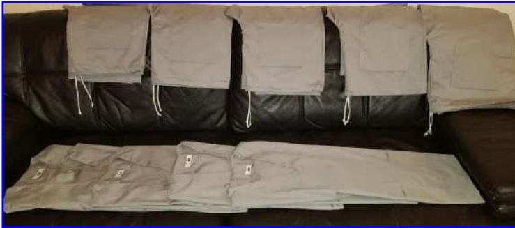
Scrubs for The Royal London Hospital