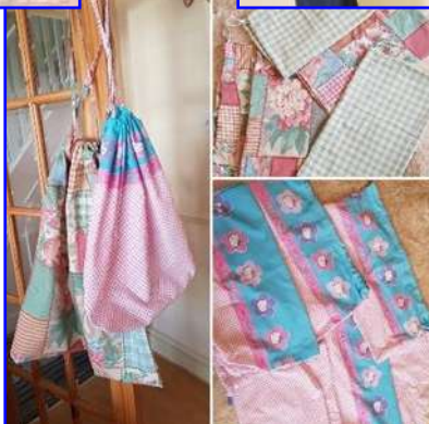
Hello Kitty' Scrub Bags