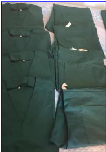
Scrubs for St James Surgery

My thoughts went straight to asking my mum for help, who during lockdown had found herself with not much to do. My mum had worked many years as a seamstress and so was able to offer valuable support to the group. So, my GCSE Textiles skills and my mum's much advanced sewing skills were put to action, and we started to make scrubs and scrub bags.